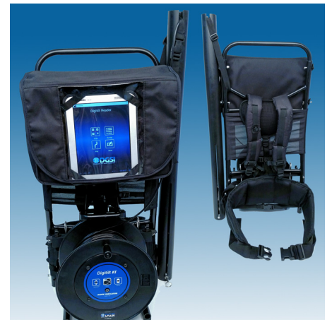
Easily take the AT system anywhere with our custom backpack

Extension Cables: Extension cables can be utilized to extend the length of a Digitilt AT System. Please note that extension cables are only compatible with detachable probes.